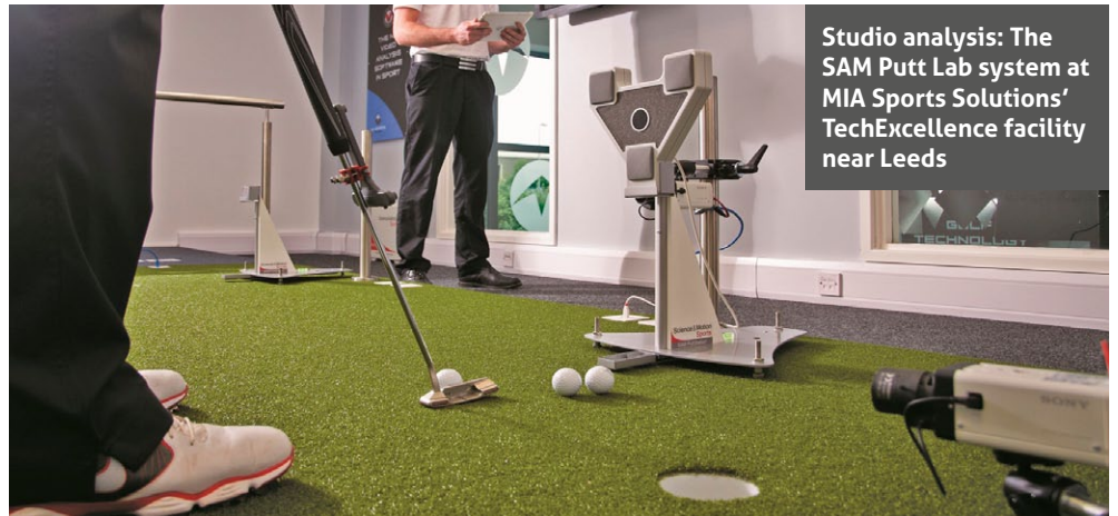
Studio analysis: The SAM Putt Lab system at MIA Sports Solutions' TechExcellence facility near Leeds

"It takes 15 minutes for a golfer to receive scientific analysis to show which of three putters is best suited to their game, and that should lead to a sale."